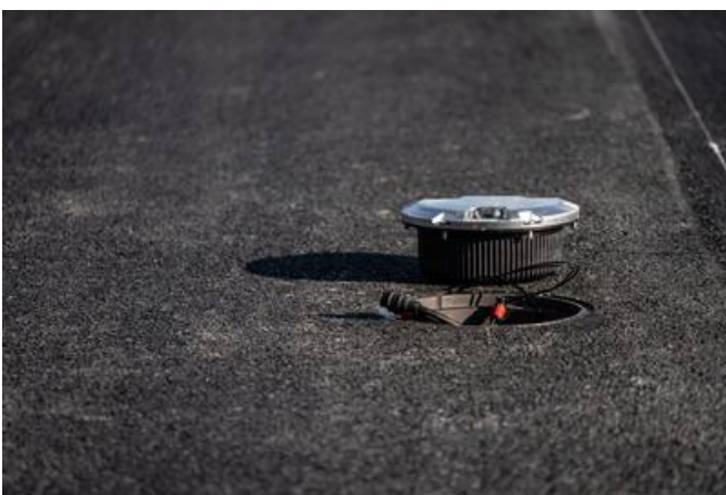
PORR replaced all beaconing lamps on the runway.

The visual aids system for navigation was designed and executed to comply with all regulations for a category III Precision Approach Runway in both directions. The team replaced all the primary and secondary circuits mounted in protection pipes, the aeronautical beacons for the runway threshold, end, centre and touchdown area, the approach system, the stop bar along with all signs and markings. In addition, the tower remote control has been upgraded.