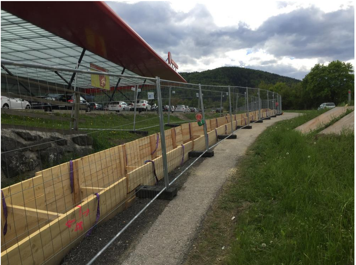
One third of the pipeline was laid in undeveloped areas; the remainder was laid under municipal and national roads.

After a construction period of 16 months, the district heating pipeline went into operation on schedule in August 2018. Since then, thanks in part to PORR's contribution, half of Villach's heat requirements have been covered by waste heat from the Arnoldstein waste incineration plant. Natural gas is only used as a failure reserve and to cover peak demand.