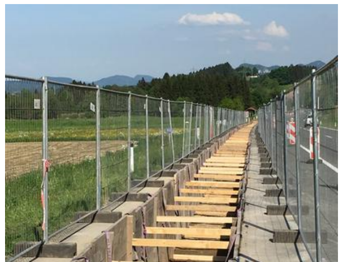
The district heating transport pipeline in Pöckau.

The pipeline runs from the heat transfer station in Villach/Warmbad along Warmbader Straße and the B83, Kärntner Straße, via Fürnitz, Hart, Neuhaus and Pöckau to Arnoldstein. Great care had to be taken to minimise the impact on traffic throughout the construction period. Traffic along Warmbader Straße in Villach was regulated by a traffic light. The area around the main road, where the flow of traffic had to be maintained while the works were being carried out, was particularly tricky. Red, weather-resistant ground markings were applied to the carriageway for the duration of the construction work and removed again afterwards. The measures set out in the permit granted by the traffic authorities had to be strictly adhered to and were continuously monitored by the authorities.