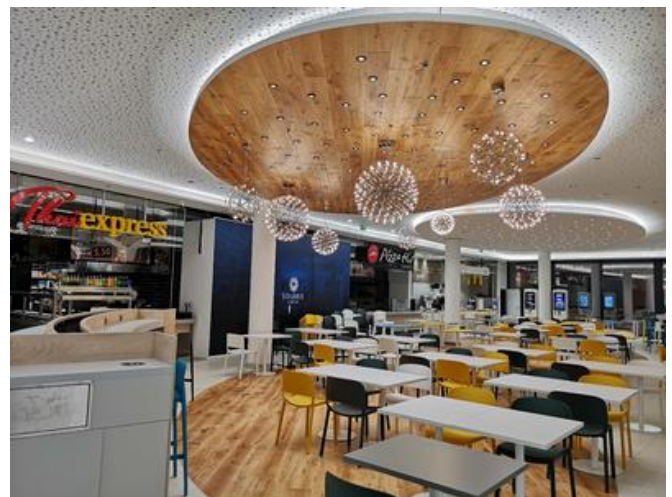
After a construction period of 20 months, the turnkey extension was handed over in May 2019.

For the turnkey handover, the building was equipped with furniture and all movable elements up to the signage.