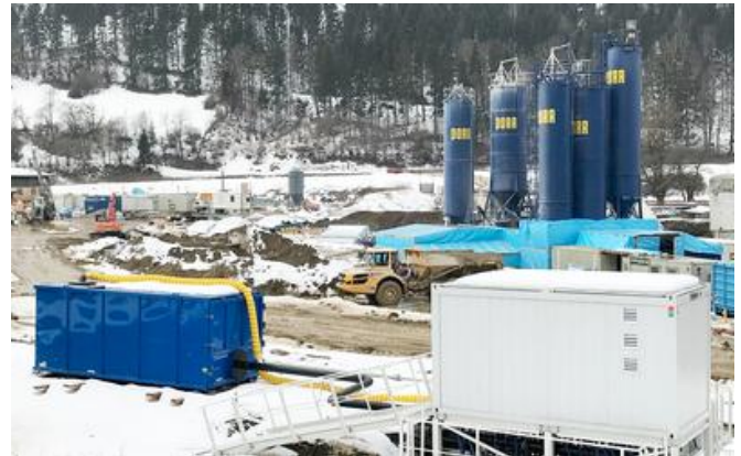
Soil gas extraction system (blue container) with a temporary exhaust line during ongoing site work.

Every hour, some 640m³ of gas is extracted and directed to a purification system with the help of 60 vacuum pumps, 26 vertical soil air probes and a surface covering the entire surface filter. The same pumps extract the gas from the subsoil and transport it to be purified by an activated carbon filter. The system measures 2.45 x 2.60 x 5.90m, and ultimately transports the clean gas via a collection line with a diameter of 200mm to the 15m tall vent stack. In order to identify the optimal location for the stack, Donau Chemie AG tasked the TU Graz with developing a local dispersion model for the exhaust gas.