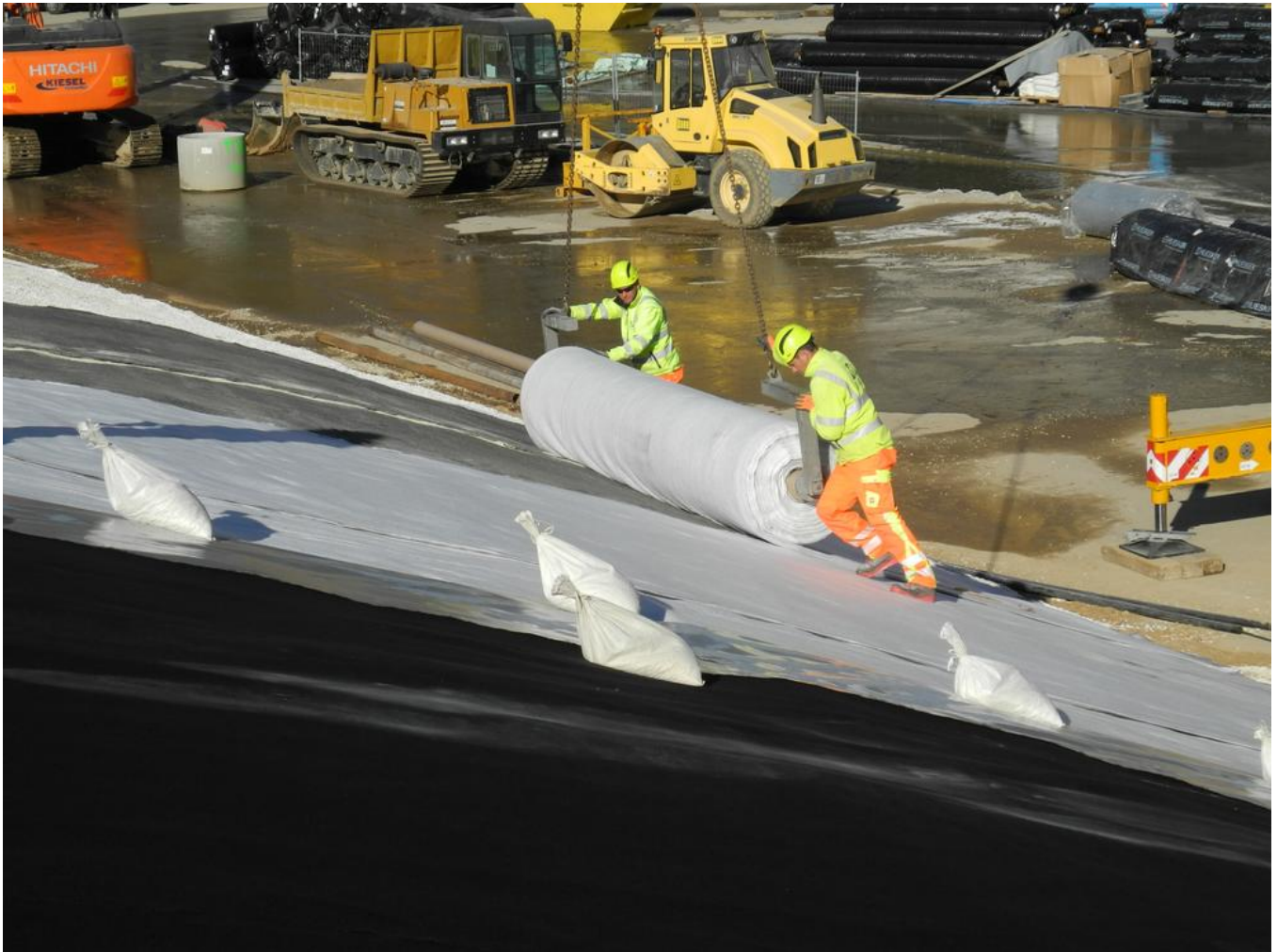
Laying the surface seal.

Instead of clearing the site as originally planned, a four-phase plan was created to implement structural safeguarding. Preliminary work was carried out in Phase 0, while Phase Ia saw the surface layer sealed up. This phase also involved boring holes for soil gas extraction. Phase Ib included installation of an activated carbon filter system to purify the extracted soil gas. In the final phase – groundwater conservation – construction work headed deeper: the site required a surrounding cut-off wall, a groundwater cleaning system, several groundwater wells within the seal as well as monitoring and control systems both within and outside of the seal. In 2016, a new partial call for tenders was issued by Donau Chemie AG for the safeguard measures in the project. The contract was awarded to PORR Bau GmbH, Specialist Civil Engineering department and IAT GmbH.