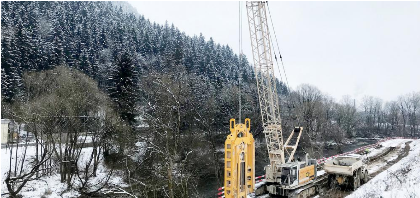
Installing the diaphragm wall.