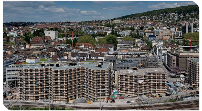
The Gleisribüne complex shortly before completion.

This heating/cooling system will supply the two office blocks in the Gleisarena complex in addition to the three Gleisribüne buildings. The direct hot water supply is also implemented via the heat pump. The hot water is stored in stainless steel containers and serves as the basis of the hot water supply. Drinking water is protected against legionella by a special control system which briefly heats the water above 60 degrees Celsius, and the building automation system ensures the heating periods are followed.