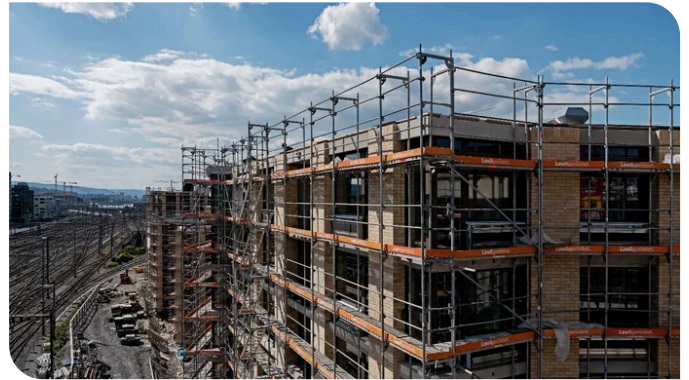
The Gleisribüne complex shortly before completion.

The floor slab and external walls of the underground level were constructed from waterproof tanking with class 2 impermeability. The basement level also supports the existing SBB tunnel and holds it in place.