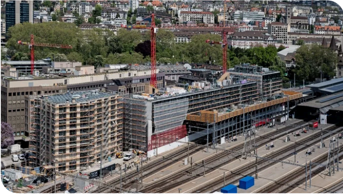
View across the tracks to the Gleisarena and protective tunnel.

In light of the extremely cramped conditions, PORR decided on a reinforced sheet-pile wall to seal the construction pit. Building on experiences from other construction sites in the Europaallee opposite, PORR successfully used vibratory hammers to drive the sheet-piles, using gravel from the nearby Sihl. The sheet-pile walls were strengthened with horizontal steel girders to