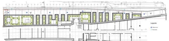
The foundations comprised 49 bored piles with diameters between 100 and 120cm.

A pedestrian/utility tunnel runs beneath a large part of the Gleisarena site, which means the building physics has to ensure that the structure disperses loads appropriately in the tunnel regions as well as into the soil. PORR implemented various measures to avoid uneven settling behaviour resulting from different foundation conditions. A total of 49 bored piles, with diameters between 100 and 120cm, were installed beneath the building components that transfer loads into the ground. To ensure even load dispersal and to absorb horizontal loads such as wind or earthquakes, pile caps were bolted together in groups.