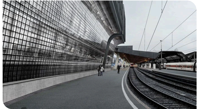
The spectacular curved glass brick facade of the Gleisarena was developed in-house by PORR.

The building plan necessitated rerouting a conduit block containing electrical cables for Zurich's main station and a number of optical fibre cables for various telecommunications providers. Since this included the main power supply for Zurich main station, and rail operations were continuing during the work, a redundant rerouting plan had to be implemented: First, the power supply was switched from the Zollstrasse substation to two other existing substations. The Zollstrasse substation could then be taken out of service and the existing conduit block decommissioned. Once this had been done, the new conduit block was reintegrated back into the grid. On completion of the work, the station was once again supplied with electricity from the Zollstrasse substation.