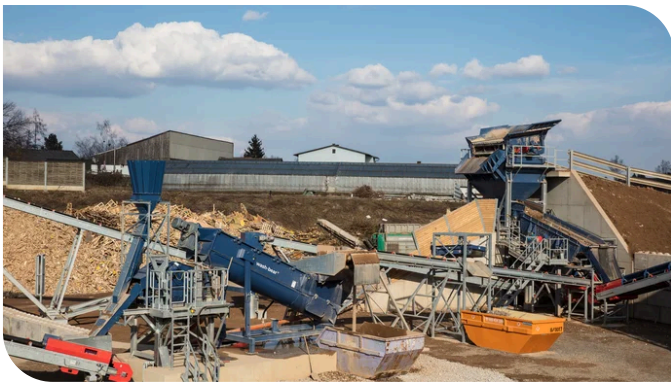
The light material separator with dewatering screen in the first extension.

Work to convert the old gravel and crushed stone processing plant began in June 2017. The first extension to the plant includes the feed hopper, jaw crusher, screening unit, impact crusher and various conveyor and stockpile conveyors. As part of the overhaul of the existing plant, new plant components were added, including the magnetic separator, feeder and operating station. The screening unit, impact crusher and jaw crusher were refurbished in collaboration with PORR Equipment Services. As part of the second extension, a further feed hopper, a pre-screening unit, a light material separator, a dewatering screen, a manual sorting system and various stockpile conveyors were installed. The recycling plant is designed for a capacity of up to 150 t/h. Due to the tight construction schedule, all construction work on the plant was completed within six months by December 2017. This enabled PORR Umwelttechnik to establish a treatment process to produce high-quality recycled construction materials as an alternative to primary raw materials. The treatment process consists of two stages, which can also be operated individually.