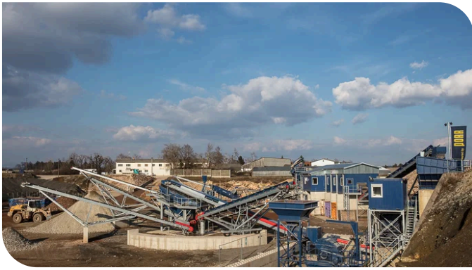
The light material separator with dewatering screen in the first extension.

From the feed hopper, the mineral construction waste is transported to the pre-screening unit via the feeder. The initial separation of the construction waste takes place here – into fine, medium and coarse fractions. The fine fraction is stockpiled via a collector conveyor and a slewing conveyor. The medium fraction is transferred to the light material separator via a feeder belt with overbelt magnetic separator. The lightweight materials are collected in skips and disposed of externally if necessary. The fraction cleaned of lightweight materials is dewatered using a dewatering screen and delivered via a further slewing belt, where the fine fraction can be added. The excess water from the light material separator and the dewatering screen is fed into the sand trap area of an infiltration basin at the site, which is operated as a sedimentation tank. The settled solids are regularly pumped out and disposed of using a pump truck. The purified water is recycled and supplied to the light material separator. This minimises the need for fresh water.