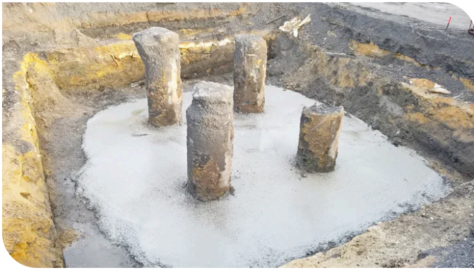
Exposed pile head with blinding layer.