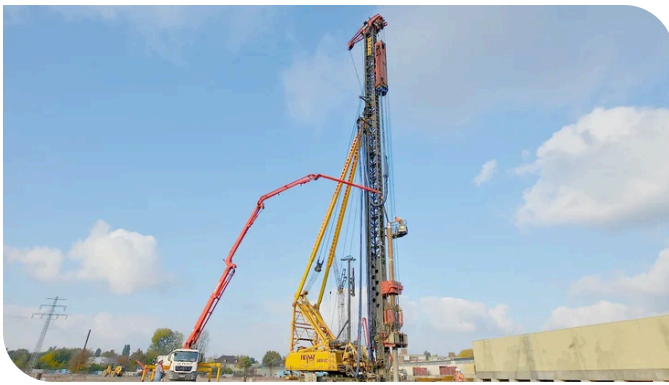
Concreting the simplex driven cast-in-situ concrete piles.