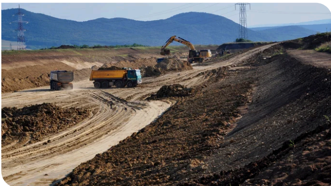
A 220kV power mast right in the middle of the motorway had to be relocated.

A key challenge with this type of contract is working around the existing utilities. In this case, it was necessary to protect or re-route gas, water, electricity and telephone lines before the main project work could begin. A particularly tricky part of this task was the re-routing of the 220 kV and 110kV overhead lines – made more difficult by the fact that thanks to bureaucratic obstacles, the necessary expropriation on the part of the end client took rather a long time.