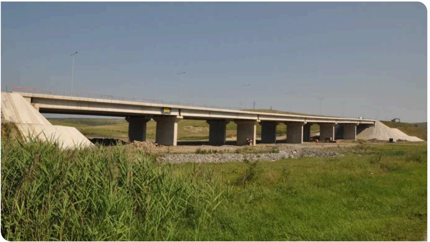
The 255m motorway bridge in Sector 5 is the longest bridge in the project.