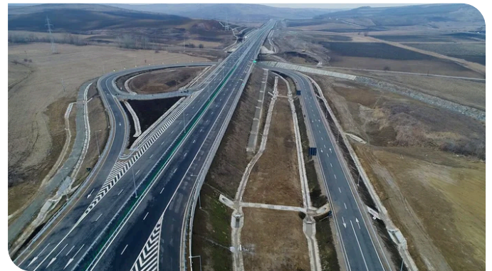
A glimpse of the comprehensive drainage measures included in the project.

Functioning drainage system is highly important for the longevity of a road. For this reason, a full 100km of surface drainage channels have been installed, as well as 5.6km of longitudinal drainage, 43,000m 3 of rock ballast to regulate the streams crossing the route, and 199 oil separators.